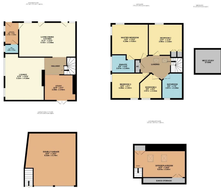
TOTAL FLOOR AREA : 2200 sq.ft. (204.4 sq.m.) approx.