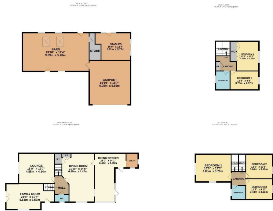
TOTAL FLOOR AREA : 3217 sq.ft. (298.9 sq.m.) approx.